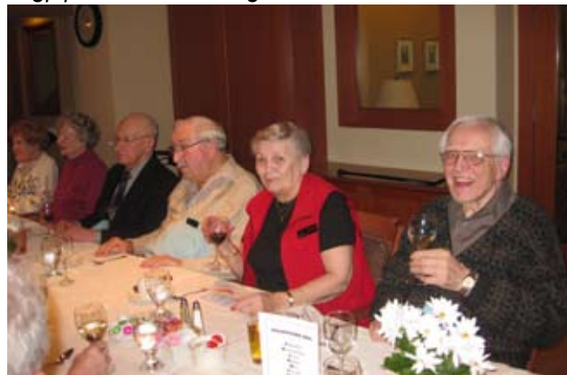
The Summerhill thanked its generous group of volunteers at a special luncheon in their honour.